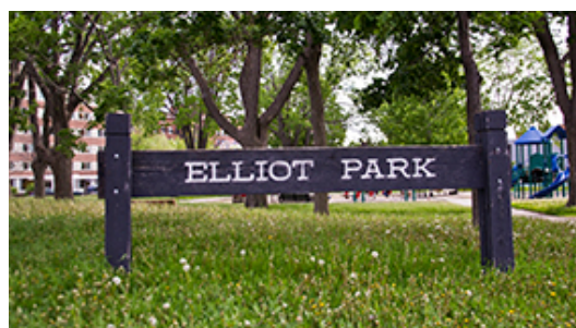
Elliot Park Neighborhood ➔

Copyright © *2016* *East Town Business Partnership*, All rights reserved.