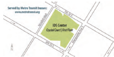
Open House Location

IDS Center - First Floor, Crystal Court 80 South 8th Street, Minneapolis