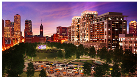
Ryan Companies Downtown East Redevelopment Project ➔